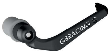
Fig. 1: ASSEMBLY

Please note: We recommend to use a medium thread lock (not supplied) for correct operation.