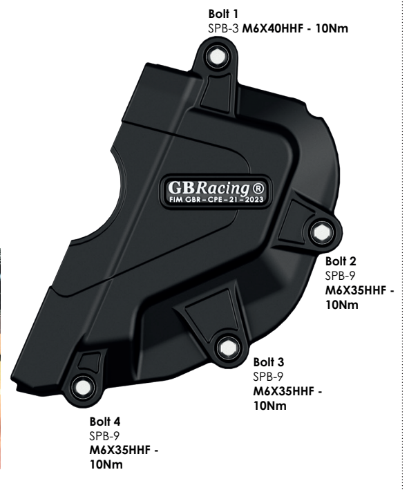
Engine Cover Set: EC-CB750-2023-SET-GBR:

EC-CB750-2023-1-GBR, EC-CB750-2023-2-GBR, EC-CB750-2023-3-GBR