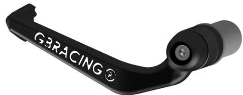
Fig. 1: ASSEMBLY

Please note: We recommend to use a medium thread lock (not supplied) for correct operation.