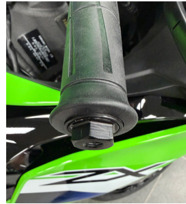
Fig. 2 BEFORE ASSEMBLY: