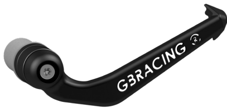
Fig. 1: ASSEMBLY